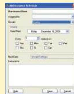
▶ Establish a maintenance schedule and review asset maintenance history