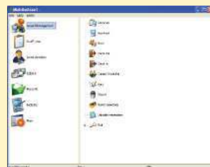
▶ Navigate MobileAsset using the intuitively-designed interface