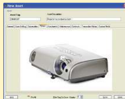
▶ Attach photos or contracts to an asset record for quick reference